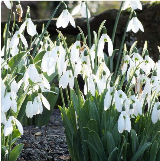
The first Snowdrops at Kew offer hope after a long winter

As a child I loved my Flower Fairy book written by Cicely Mary Barker. Each flower had a picture of a fairy dressed to match the particular flower."