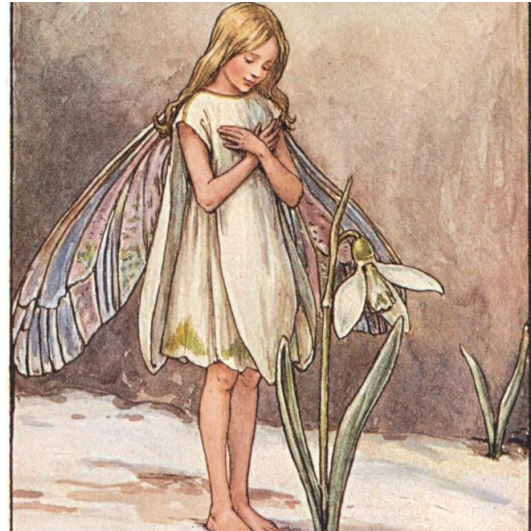
The Snowdrop Flower Fairy