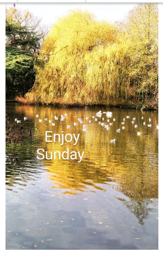
Najma and Salie sent us these photo of winter light and shadows. Do you have any interesting photos taken in winter?